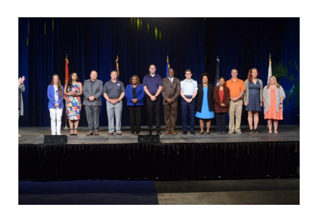
Photo caption: ASMC 2022 – 2023 national award honorees celebrated at PDI 2023 in St. Louis, MO.